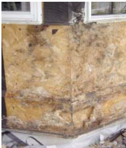
Figure 1. Where stucco (top photos) and cast stone (bottom) have been installed on the same home, the author frequently finds more severe moisture and rot damage under the cast-stone portions of the exterior. One reason is that the stucco terminates at the bottom with a weep screed, while the cast stone sits in a bed of mortar and grout, directly on a foundation ledge, with no weeps or flashings.