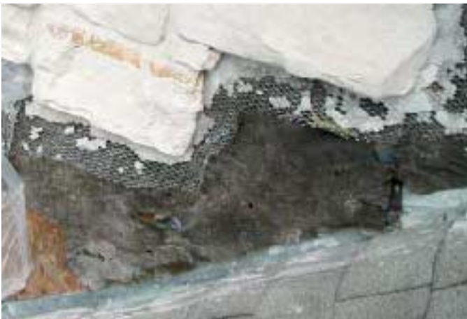
Figure 3. Undersized or omitted diverter — or kickout — flashings allow water to flow beneath the cast-stone facade (above). Window flanges that lap under instead of over building paper can bring rain water into direct contact with the sheathing (right).