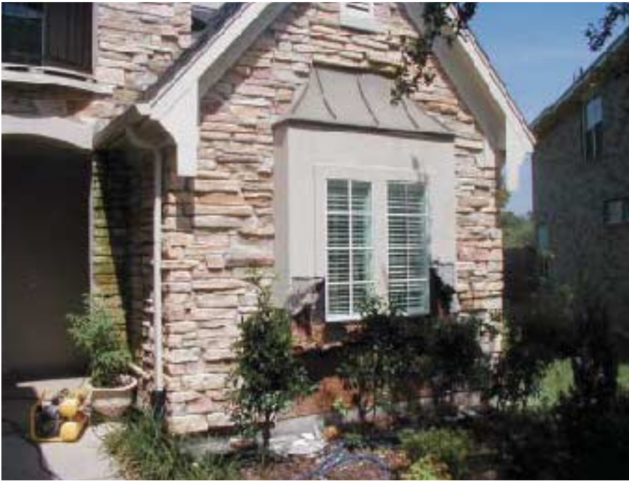
Figure 2. Long, flat “ledgestone” pieces like this create many horizontal shelves where water can stand and soak into grout joints.